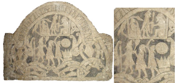
Sandastone, In Historiska Museet, Stockholm.

of death. My interpretation of the scene is connected to that of Hugo Jungner presented in Fornvännen 1930. The top of the picture could be a death world, like Valhalla with Odin and Freya welcoming a dead person. The role of Odin is strengthened by the triskele, the spear and the bird (Odensvala). If the circle below represents the sun, the middle part can be seen as the earth level and the part below the sun is perhaps a pyre and we see three persons holding some kind of symbols or tools, sometimes interpreted as the symbols of Odin,