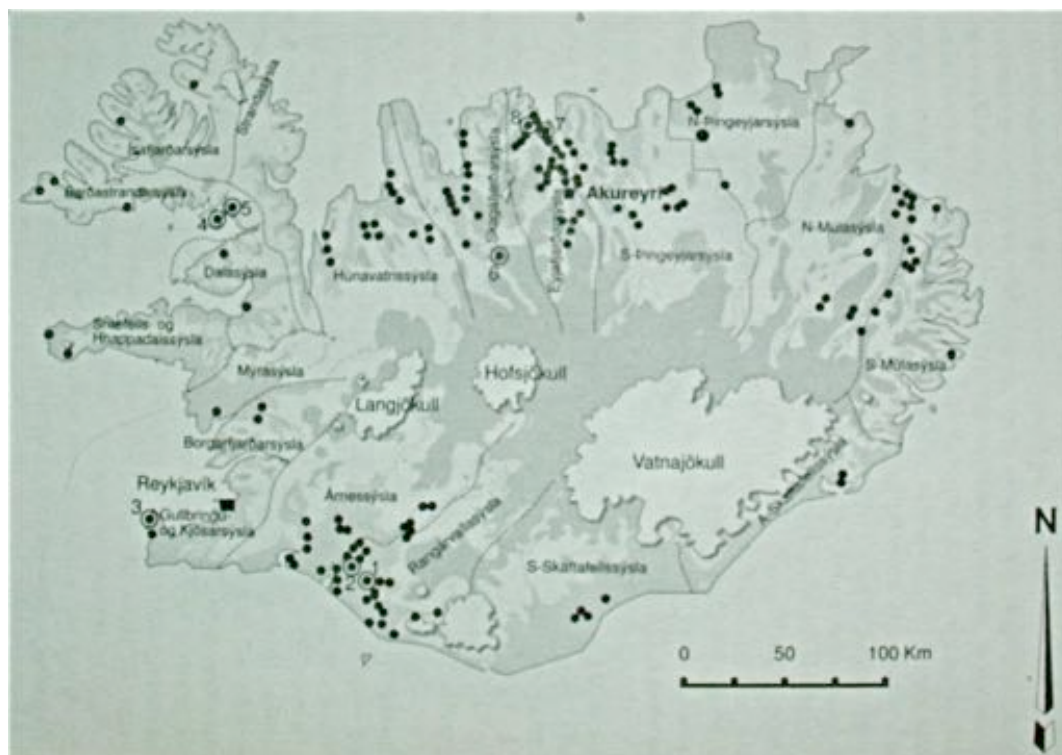
The distribution of gravesites in Iceland. Circled points are cemeteries with 5 or more graves. Einarsson 1995:47.

written sources and not interpreted in its own (Einarsson 1995:41-45; Eldjárn & Friðriksson 2000:609; Vésteinnsson 2007). The majority of the artefacts found in Icelandic graves are of Norse character nevertheless considering the Pagan burial tradition with cremations and monumental structures in Scandinavia the Icelandic graves are hard to explain. Graves in Iceland are also hard to find due to the lack of monumental structures, most graves lie under flat ground (Einarsson 1995:52). Eldjárn lists only four certain mounds in Iceland; in Grafargerði, Dalvík and Lækjarbakki (1956:206). Also graveyards interpreted as Christian and dated to pre-conversion times are found, as well as circular graveyards in contrast to the otherwise Nordic rectangular. Early private churches as symbols of wealth or Christian belief are found in Iceland and those have been compared to similar buildings in Ireland, Scotland and Greenland where also circular graveyards are used (Kristjánsdóttir 2004:133f,137). In general the graves cannot be defined regarding religion; both Paganism and Christianity are formed after the culture and environment it is practised in and in Iceland burial characteristics from both views are present.